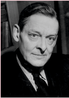
T S Eliot