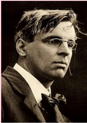
W B Yeats