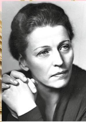
Pearl S Buck